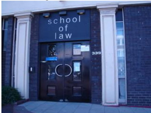
School of Law