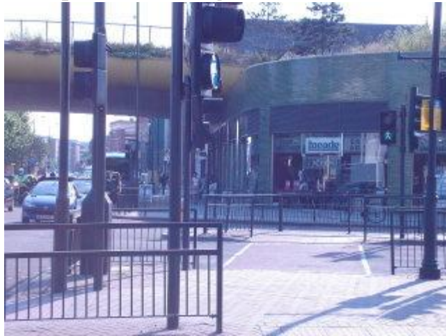
Crossing towards Green Bridge