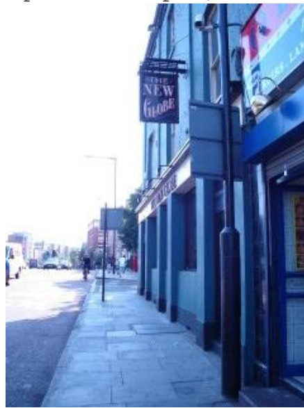
The New Globe