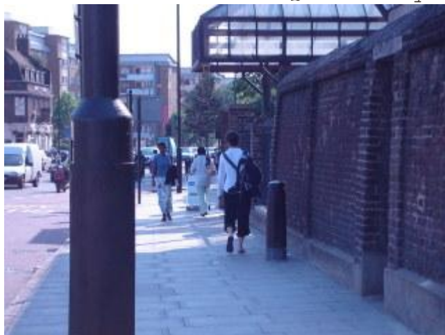
Near QM Library, looking West