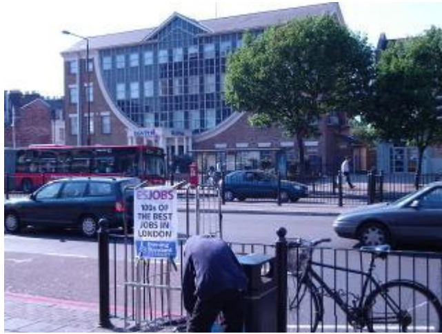
Outside the tube