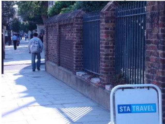
Near Barclay's, looking West