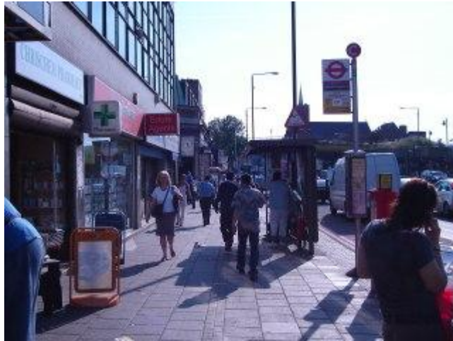
Looking west (LEFT) from tube