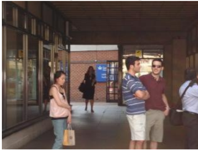
Near Barclay's, looking North (to your right)