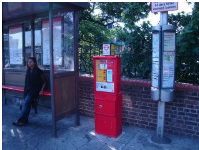
Bus stop on Canal Bridge