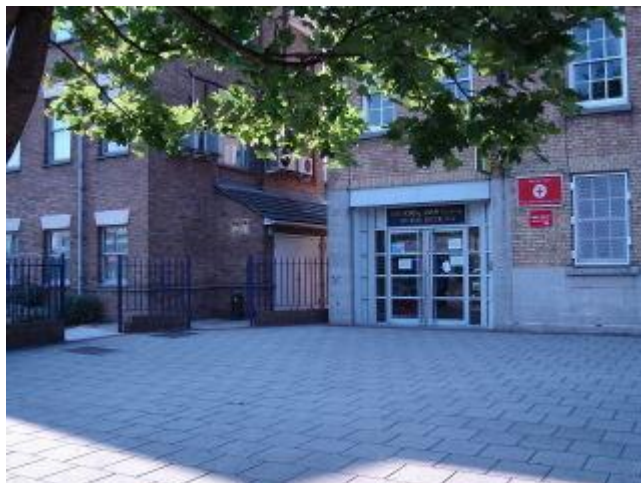
Across the street from tube