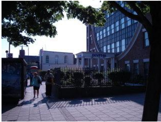
West towards Mile End