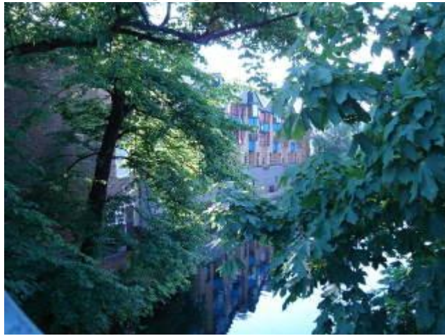
Looking north over Canal Bridge