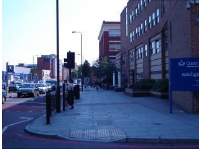
Eastgate, looking West